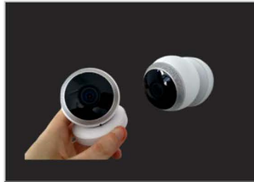
VISIBLE OPAQUE MATERIALS