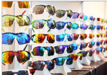
SUN LENS DYES