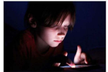
HEV LIGHT ABSORBERS