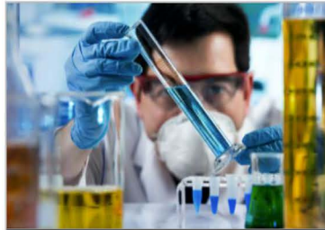
DYES FOR COATINGS