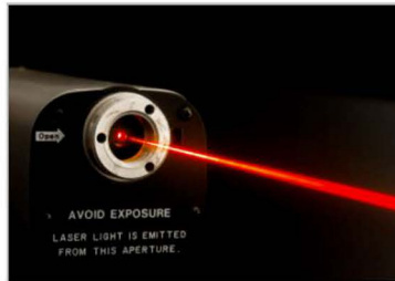
LASER ABSORBING COMPOUNDS