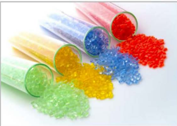
FORMULATED DYE PELLETS